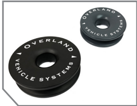
T6 6061 AIRCRAFT GRADE ALUMINUM