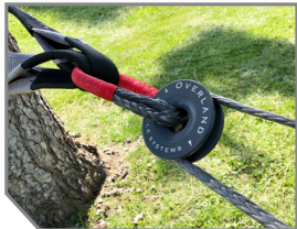
WORKS WITH OTHER RECOVERY GEAR

The Overland Vehicle Systems Recovery Ring is designed to make recovery safer, faster and more reliable. Its unique design is manufactured out of T6 6061 Aircraft Grade aluminum which won't rust or corrode. This simple recovery tool used in conjunction with a soft shackle replaces the traditional snatch blocks and operates at a much higher working load which makes recovery safer and easier. This unique system is safer than the outdated snatch blocks because it doesn't store kinetic energy like traditional rigging which could be catastrophic if a failure occurs. The Overland Vehicle Systems Recovery Ring is the safer way to do off road recovery. This heavy duty recovery ring is designed for use with soft shackle and can be used with any standard tow strap. Whether you're stuck in the mud or need to pull a vehicle out of a ditch, the Overland Vehicle Systems Recovery Ring is the perfect solution. Order yours today and be prepared for anything the trail throws your way.