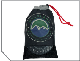
STORAGE BAG INCLUDED