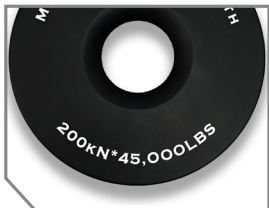
50% STRONGER THAN STANDARD SNATCH BLOCK